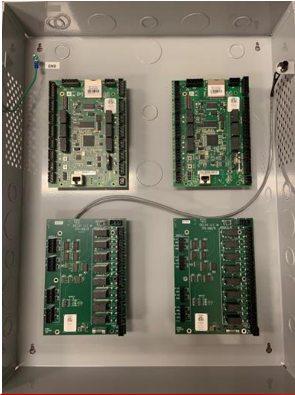
The 1700 includes 4 supervised or unsupervised inputs and 4 auxiliary outputs with field replaceable relays, expandable via daisy chain up to two 170 I/O expansion boards per 1700 controller.