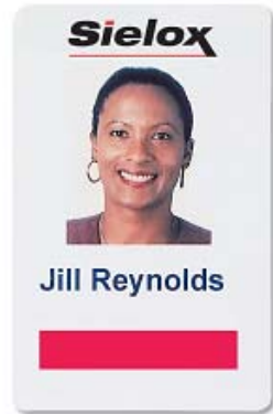
2.12" 54.04 mm Graphics Quality Direct Print