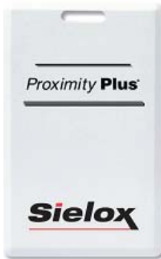
2.12" 54.04 mm Clamshell