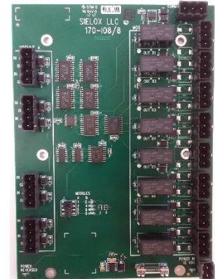
CN-SLX-170-IO8/8 Combination Board with 8 supervised inputs and 8 relay outputs