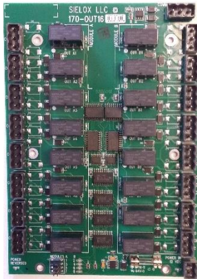
CN-SLX-170-OUT16 Output Expansion Board with 16 relay outputs

Sielox introduces a new line of 170 I/O Expansion boards providing a low-cost solution for all I/O applications, large and small. Typical applications include elevator control, alarm monitoring, alarm annunciation, and building control. Up to two I/O expansion boards can be connected to each 1700/2700 controller in any combination.