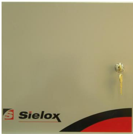
Sielox Removable Door

The large Sielox Enclosure can support an Input/Output expansion board with two 1700 Controllers allowing users to expand to 60 inputs or 60 outputs.