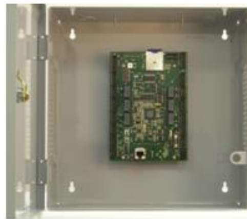
Small enclosure with one 1700