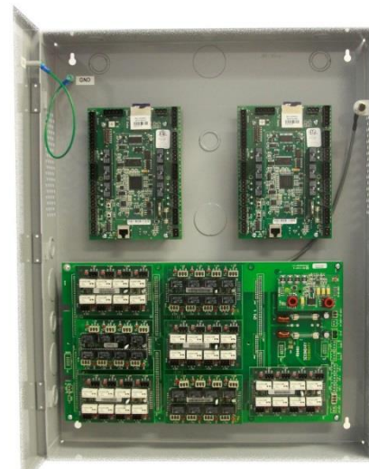
Large enclosure with two 1700s and one legacy Input /Output Expansion board